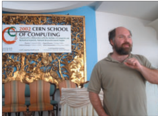
Figure 1: Carl Kesselman at the Cern School of Computing 2002 in Vico Equense, near Naples, Italy. The co-author of the first book on grid computing is one of the founding fathers of grid computing.

To run a program on a Grid, you need some experience with middleware. Its role can be compared to the network layer of an operating system. An application that wants to transfer data across a network does not need any knowledge of the underlying network hardware. In a similar way, a