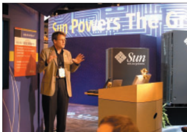
Figure 2: Ian Foster – just like Carl Kesselman, Ian is one of the grid founding fathers – seen at the Sun booth at the Supercomputing 2001 fair in Denver, CO. The slogan "Sun Powers The Grid" shows that the industry is genuinely interested in the new technology.

Middleware has only restricted potential for hiding the underlying computing infrastructure. As long as Grid users send programs that the target systems can handle interpretatively, things should be fine (the same thing applies to interpreters with just-in-time compilers). What happens if they start using pre-compiled binaries? This is a question that needs looking into – a large-scale Grid network can contain any kind of (potentially incompatible) hardware, be it a 64-bit RISC architecture, a 32-bit Intel box, or something completely different.